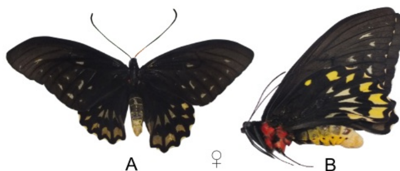
Fig. 5. Color characteristics of female O. croesus at the height of 800 m above sea level (A= seen from the top; B= seen from the beside).

The body color of male O. croesus is generally very bright with a beautiful color combination so that it attracts the attention of female O. croesus to copulate. The body color of female O. croesus generally has dark colors dominated by dark brown color, but it has good combinations of wing color and the color of other part of the body, so it looks beautiful.