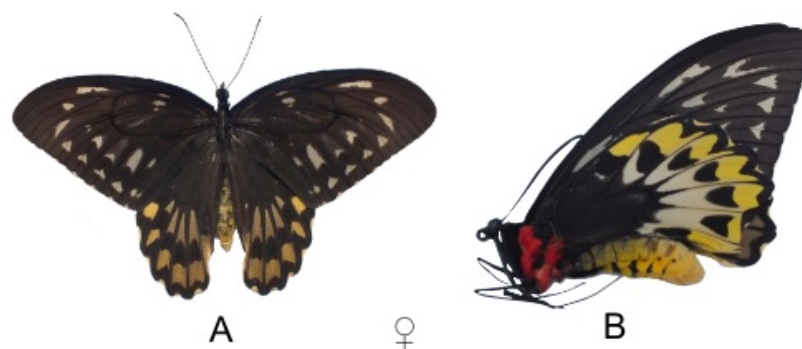
Fig. 4. Color characteristics of female O. croesus at the height of 400 m above sea level (A= seen from the top; B= seen from the beside).