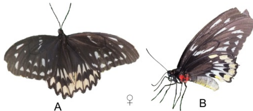
Fig. 2. Color characteristics of female O. croesus at the height of 20 m above sea level (A= seen from the top; B= seen from the beside).

The data obtained in this study are in the character descriptions of the body color variations of O. croesus female butterflies as presented in (Figs. 2, 3, 4, 5 and Table 1).